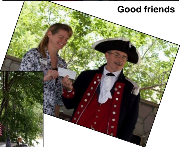
and a donation to the President of C.A.R.