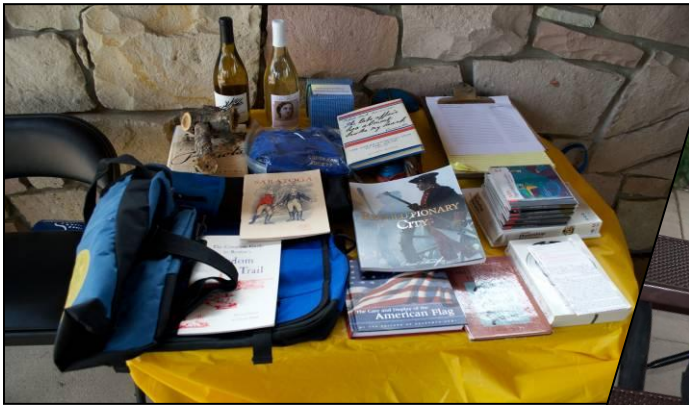
Ben Franklin table