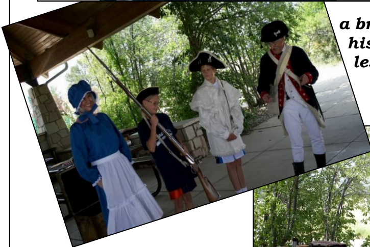
a brief history lesson